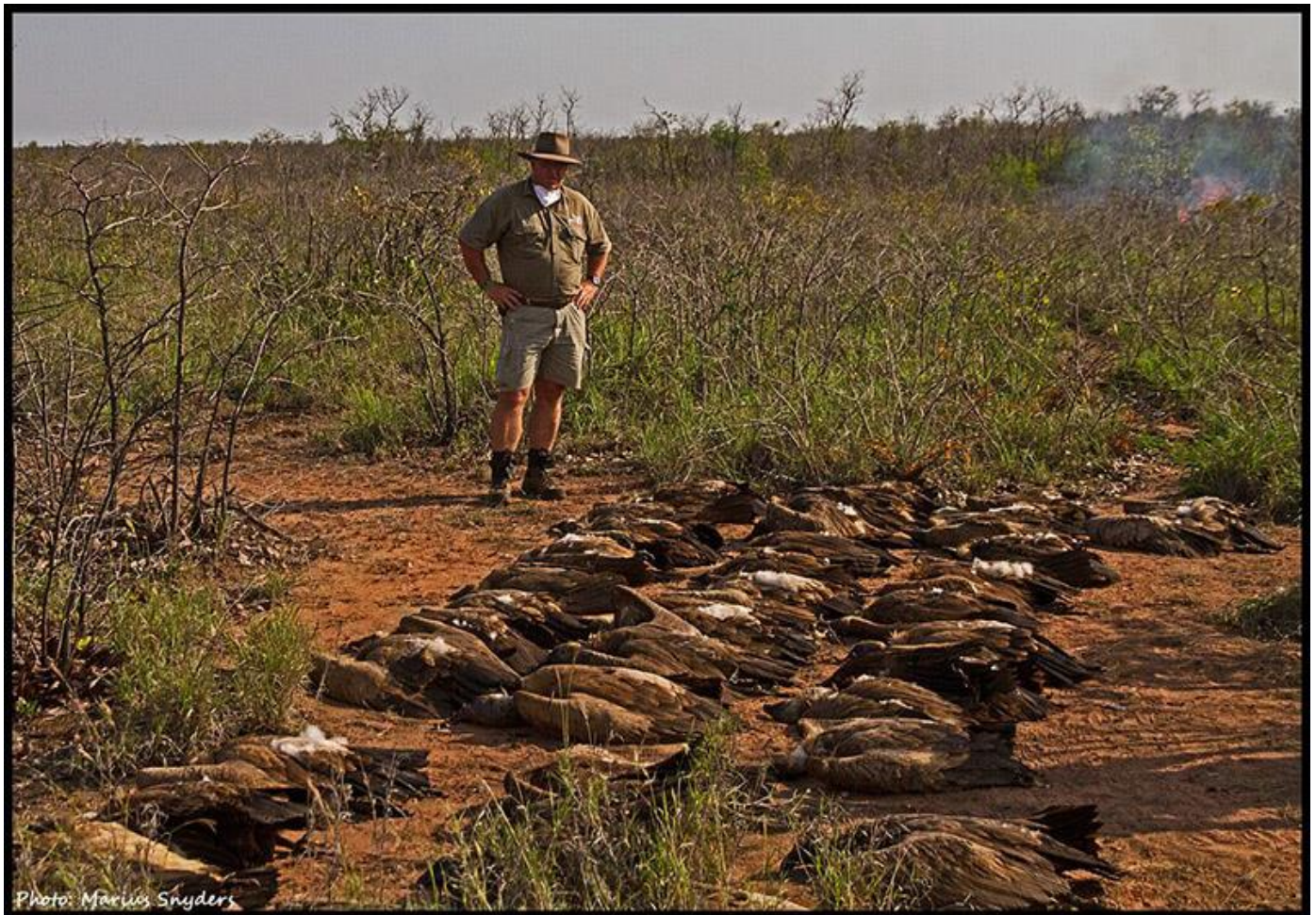
A shocking sight: the dead vultures found on the scene.

Early reports showed that the elephant had probably been shot after which chunks of meat were removed from both the rump and spine and Temik spread on the exposed areas.